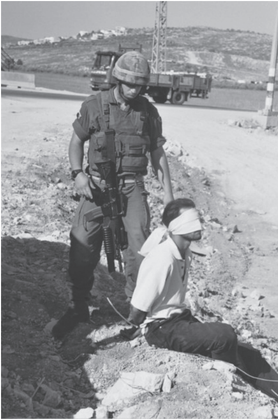
7 Huwarra checkpoint, 2004

decision-making process and creating a firmer ideological platform. This will give clear guidelines for CPW's mission and conduct at the checkpoints. It is to be hoped that this platform will be broad enough to accommodate a wide spectrum of ideological commitment, yet without compromising the political message that underlies its humanitarian activism.