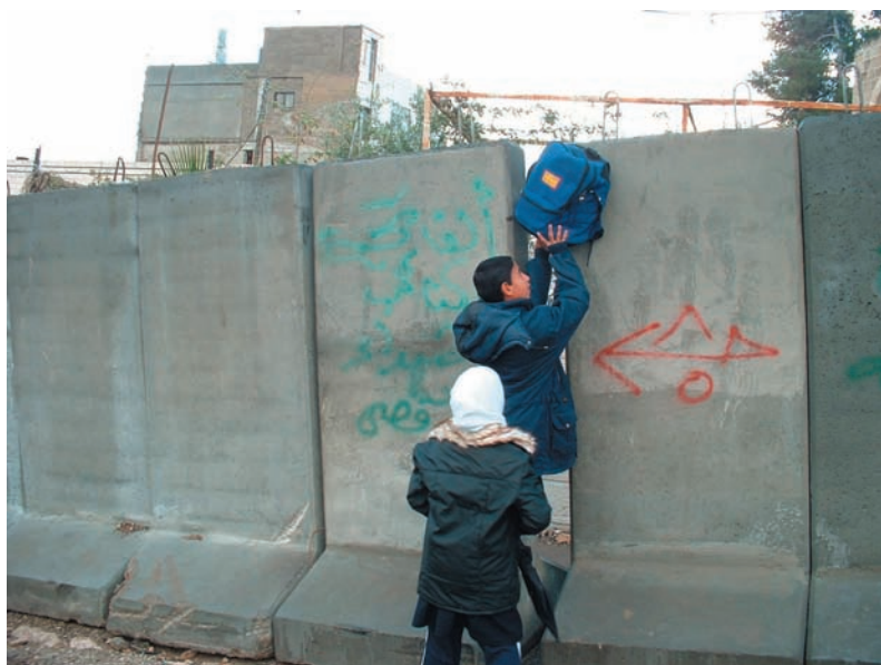
5 The Annexation Wall at Abu Dis, near Jerusalem