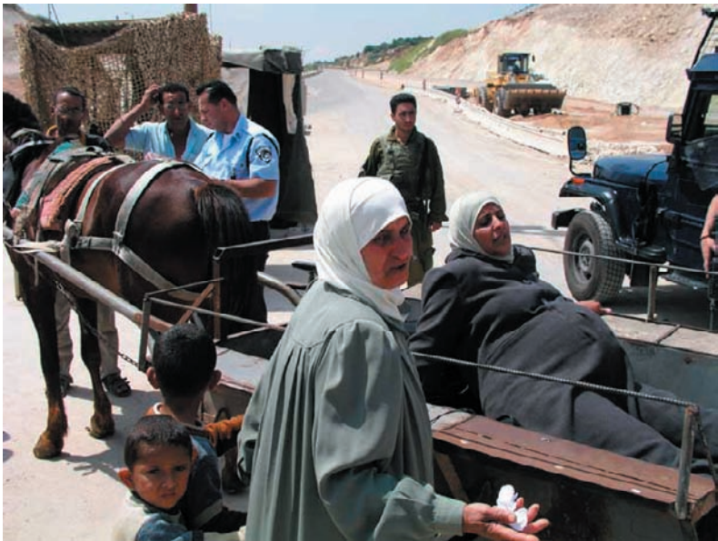
8 Jubarra checkpoint, 2005