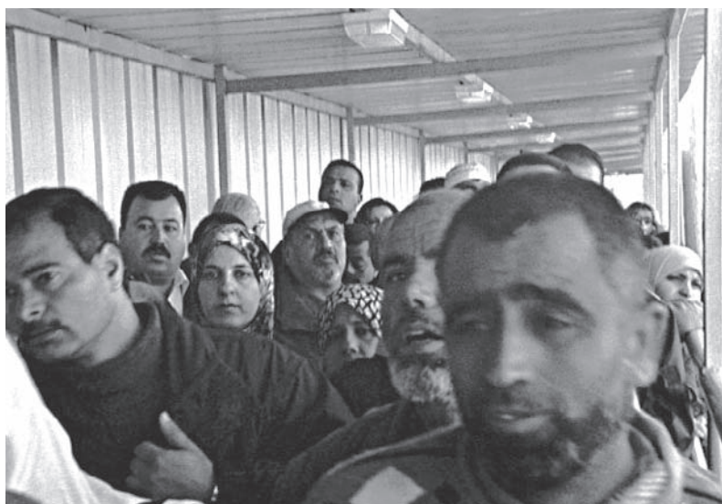
3 Bethlehem checkpoint, 2003

the Occupation confronting them. They must see themselves as they are reflected in the eyes of the beholder-oppressor: as potential or actual criminals. Though by no means quiet, they are silenced. They have no say in what goes on, both at the immediate, personal level and in the wider political context. They are robbed of agency as individuals and as a people. Their persistence in attempting to reach their places of work, education, health care and such services as still exist in the West Bank, is a silent, persistent, form of resistance. It is not only the determination, but also the necessity, to survive (Rosenfeld 2003–04).