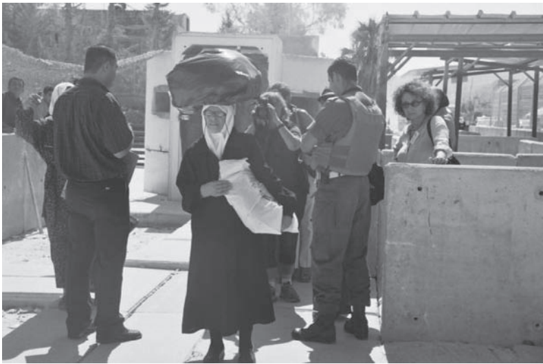
1 Beth Iba checkpoint, 2004

ness, visit family. The process of acquisition is equally long, arbitrary and uncertain. Furthermore, permits are issued for different, often very short, periods of time and cease to be valid whenever there is a closure of the West Bank cities and villages, as in October 2003 when, as a collective punishment for a suicide bombing in a Haifa restaurant, all three-month permits were declared invalid and Palestinians were ordered to take out permits with a date of issue after 7 October (see Appendix 2). In such cases, the whole application process must be repeated, with no guarantee of success. In order to acquire a work permit in Israel, the applicant's employer must also submit a request on his/her behalf.