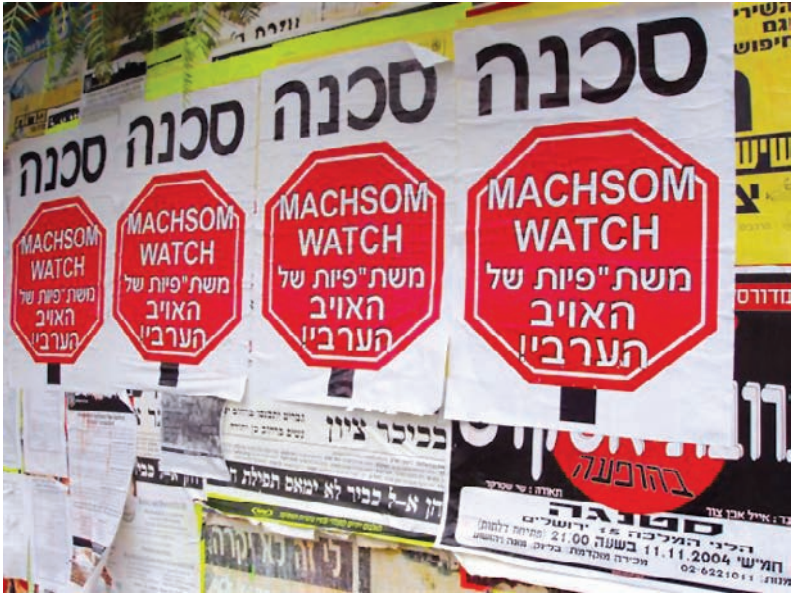
8 Poster reading: 'Danger MachsomWatch - collaborators with the Arab enemy!' Jerusalem 2005