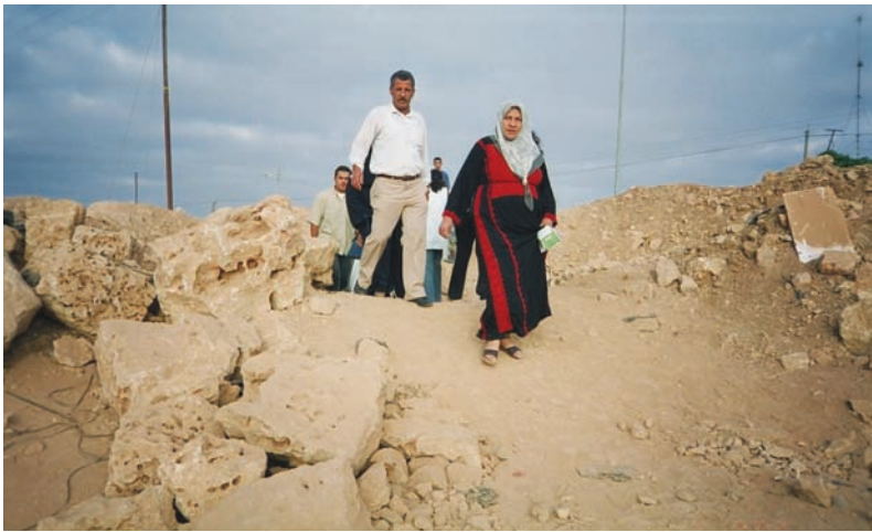
2 Blockaded village, West Bank, 2003