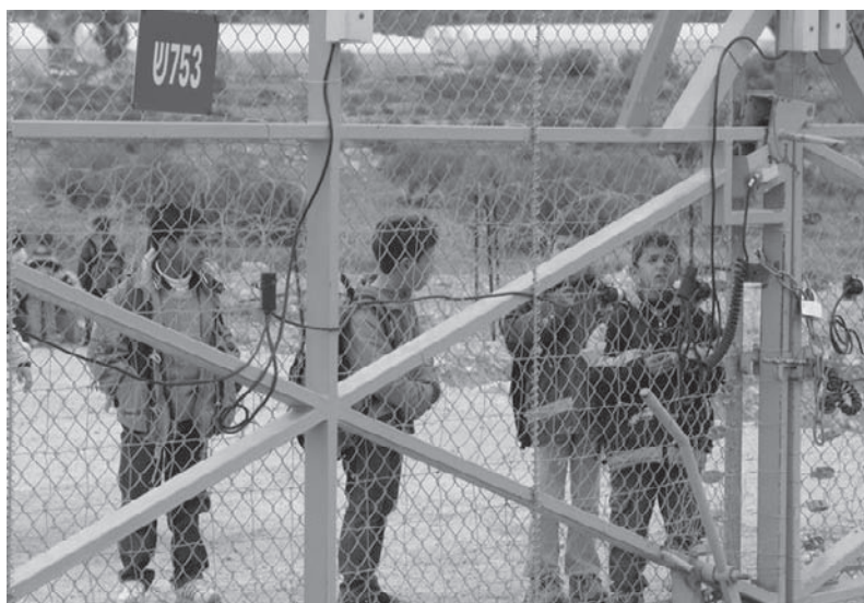
4 Waiting to cross the Annexation Wall, 2004

of the [economically crucial] olive picking season. (CPW Reports of 8, 13, 10, 20 October 2003)